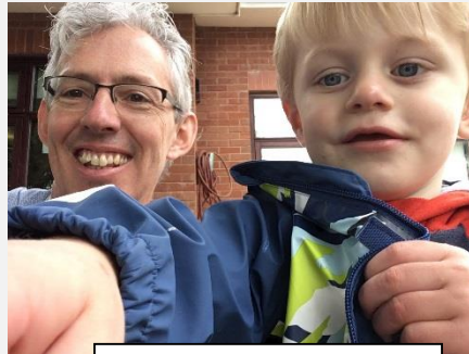
Selfie time in Sunbeams!