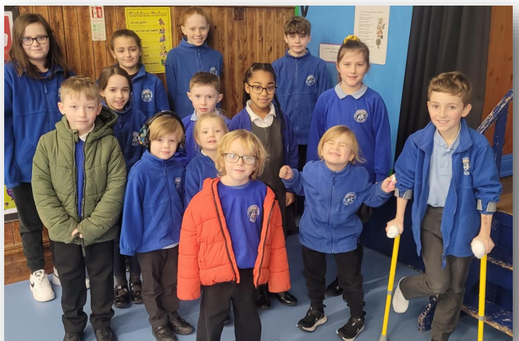
Photo: Term 3 Headteacher's Tea Party recipients

"Love each other as I have loved you." John 15:12