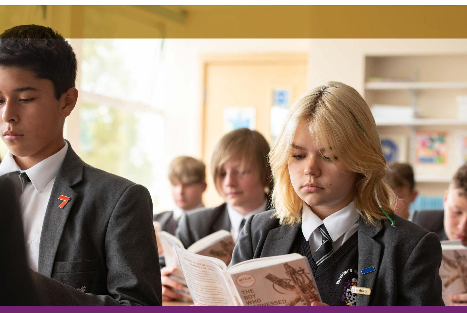
ACHIEVING HIGH GRADES

"Thank you for having confidence in me, in giving me additional responsibility as a prefect and helping me to achieve high grades. It has been an honour to be part of Buckler's."