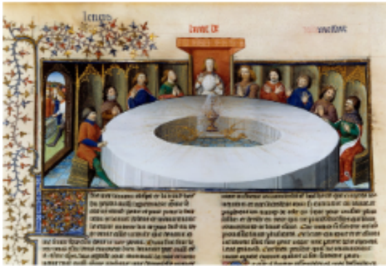
From a manuscript of Lancelot and the Holy Grail (c. 1406)

'When I came to you, I did not come with eloquence or human wisdom as I proclaimed to you the testimony about God. For I resolved to know nothing while I was with you except Jesus Christ and him crucified.' (1 Corinthians 2:1-2)