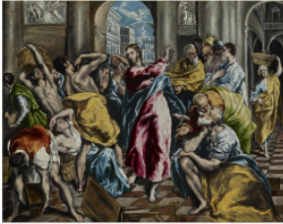
'Purification of the Temple' by El Greco (Doménikos Theotokópoulos) (1600)

“He said to them, “It is written, ‘My house shall be called a house of prayer,’ but you make it a den of robbers.” (Matthew 21:13)