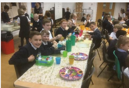
Children who have really impressed lunch staff over the week with their behavior are invited to sit at the 'Special Table'.