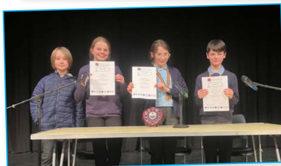
The Speak Out team with their awards.