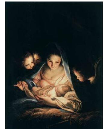
Virgin And Child - Jesus Mafa (1973) The Holy Night (The Nativity) - Carlo Maratti (1650s)