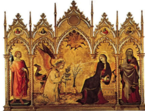
Annunciation with St Margaret and St. Ansanus - Simone Martini (1333)

I wonder what it would have been like. I imagine Mary was just going about her daily business, maybe doing some cleaning or preparing some food. Maybe she was getting ready for bed or even asleep and something woke her.