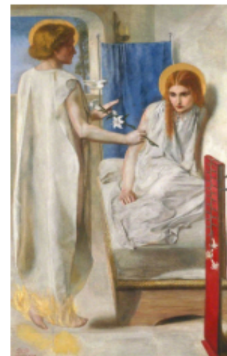
Ecce Ancilla Domini! - Dante Gabriel Rossetti (1849-50)

In the different pictures I've included, the angel is portrayed in many different ways and Mary's responses are also quite different - rejection, confusion, fear. I imagine that at first this news may have produced all of these emotions. 'Even though you don't have a husband, you are going to have a baby and he will be the son of God and his kingdom will never end.' In that day and age, being pregnant without a husband might have led to a woman being stoned to death. Even if you could keep it a secret from the village, it could lead to rejection and possible abandonment from your own