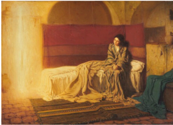
The Annunciation - Henry Ossawa Tanner (1898)

'...The angel said to her, "Do not be afraid, Mary; you have found favour with God. You will conceive and give birth to a son, and you are to call him Jesus. He will be great and will be called the Son of the Most High. The Lord God will give him the throne of his father David, and he will reign over Jacob's descendants forever; his kingdom will never end." (Luke 1:30-33)