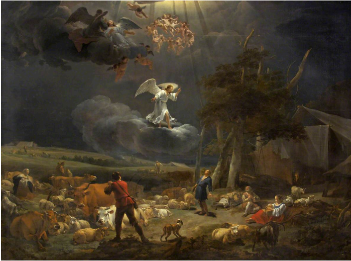
The Annunciation To The Shepherds - Nicholaes Pietersz Berchem (c.1630)

'And there were shepherds living out in the fields nearby...An angel of the Lord appeared to them, and the glory of the Lord shone around them, and they were terrified..."Do not be afraid. I bring you good news that will cause great joy for all the people. Today...a Saviour has been born to you...This will be a sign to you: You will find a baby wrapped in cloths and lying in a manger."' (Luke 2:8-12)