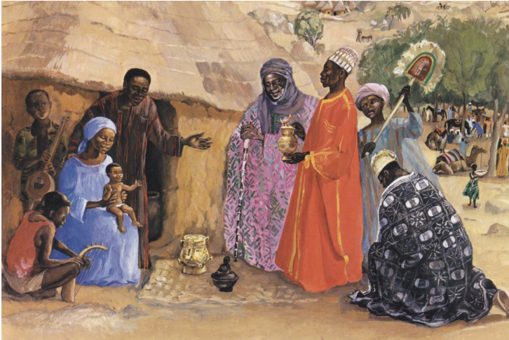
Visit Of The Three Wise Men - Jesus Mafa (1973)

'When they saw the star, they were overjoyed. On coming to the house, they saw the child with his mother Mary, and they bowed down and worshipped him. Then they opened their treasures and presented him with gifts of gold, frankincense and myrrh.' (Matthew 2:10-11)