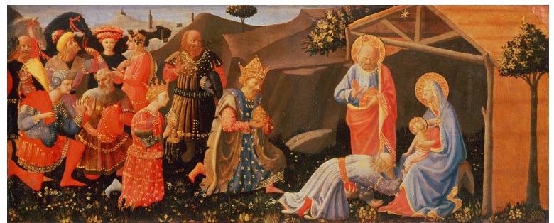
The Adoration Of The Kings - Zanobi Strozzi (1433-34)

But what of those gifts? They seem a bit unusual, don't they? Not the sorts of gifts you'd give a child.