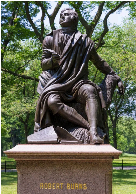
Statue of Robbie Burns in New York

"Woe to you, teachers of the law and Pharisees, you hypocrites! You are like whitewashed tombs, which look beautiful on the outside but on the inside are full of the bones of the dead and everything unclean." (Matthew 23:27)