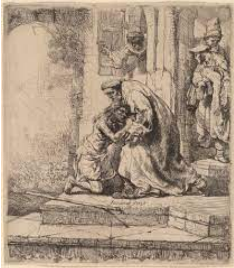
The Return of The Prodigal Son (etching) - Rembrandt Van Rijn (1636)

'But while he was still a long way off, his father saw him and was filled with compassion for him; he ran to his son, threw his arms around him and kissed him.' (Luke 15:20)