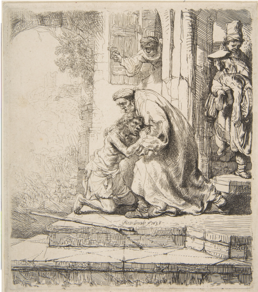
The Return of The Prodigal Son (etching) - Rembrandt Van Rijn (1636)

must have preempted this, which is why he included the other son in the parable ( Luke 15:25-32 ).