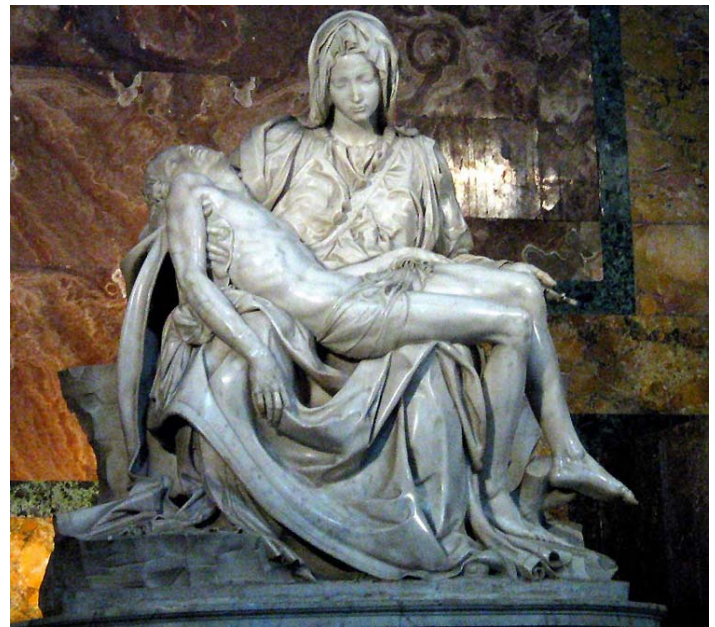
Pietà – Michelangelo Buonarroti (1499)

Although Christianity may be on the decline in this country, there are Christians all over the world now. This is no longer a Western religion (in fact it never was). It is a faith that transcends background, country and culture. Every year, it reaches thousands of people who previously had no belief in God and there are literally tens of thousands of people all over the globe who every year change their faith and start following Christ. This change is not only life changing but also life threatening, as their belief in Jesus puts them in danger of attack from members of their previous faith which can sometimes include their own families. But it is a risk they are willing to take. The question again is why ?