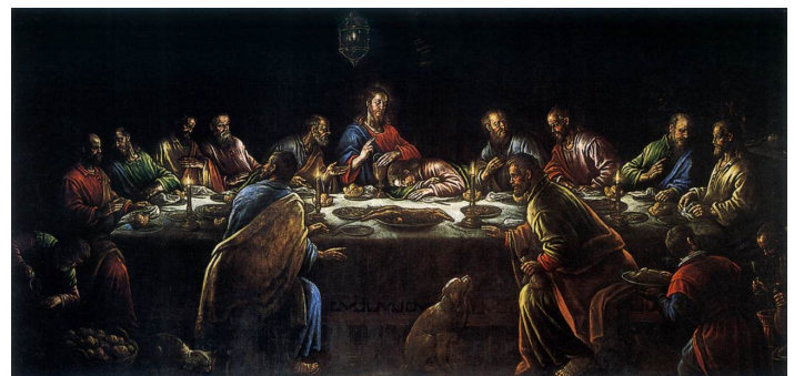
The Last Supper by Leandro Bassano (c. 1578)

Like King Arthur's table, Jesus is the great leveller. It doesn't matter how the world views you, the Bible says that all have missed the mark and everyone needs God's forgiveness. No amount of money, followers, botox or post-nominal letters will get you any nearer to being accepted by God. The wonderful news is that everyone can be accepted and valued equally in God's eyes because of Jesus' sacrificial love and death on the cross.