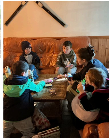
Mendip Activity Centre Year 4 Residential