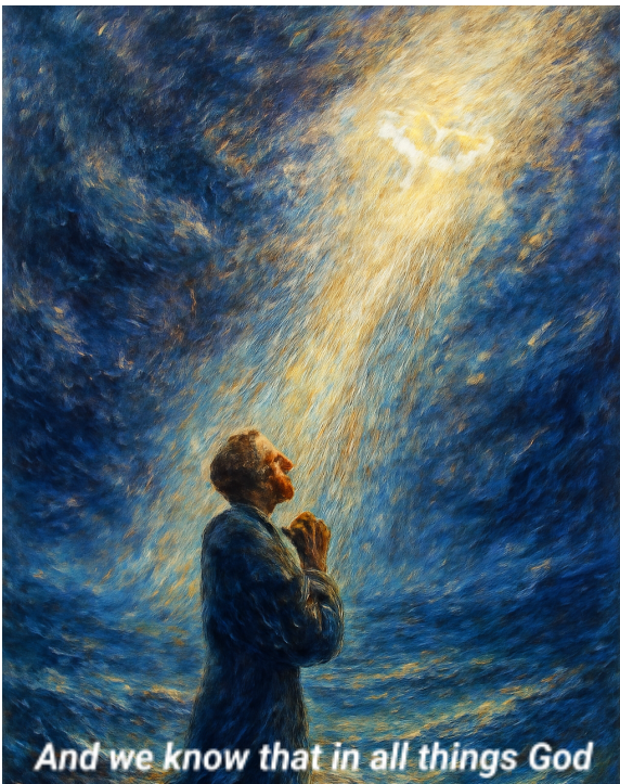
And we know that in all things God works for the good of those who love him, who have been called according to his purpose.

First, we often won't even think about giving up our own will unless things start to go wrong. The deeper our mistakes and sins go, the less we notice them; they're like hidden problems. Pain, on the other hand, is obvious—it's something we can't ignore. Everyone knows when something is wrong because it hurts. We can sometimes ignore even our own foolishness or indulgence, like watching someone eat too much food without really paying attention to what they're doing. But pain? It demands attention. It's like God's way of calling out to us when we're too distracted or numb to listen. He whispers in our pleasures, speaks in our conscience, but when we're in pain, it's as if He's shouting at us; it is his megaphone to rouse