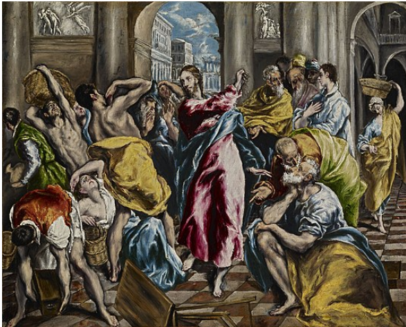
'Purification of the Temple' by El Greco (Doménikos Theotokópoulos) (1600)

'He said to them, "It is written, 'My house shall be called a house of prayer,' but you make it a den of robbers.'" (Matthew 21:13)