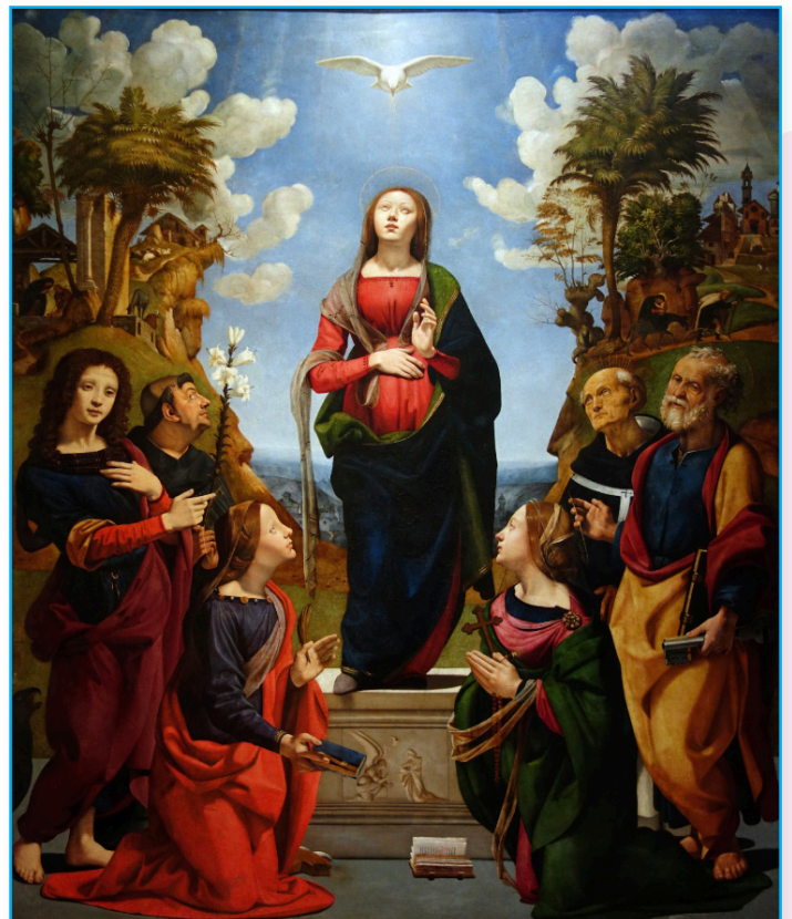
Immaculate Conception with Saints - Piero di Cosimo (c.1485-1505)