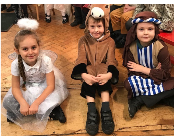
I am sure you will enjoy all class performances uploaded onto class google pages...