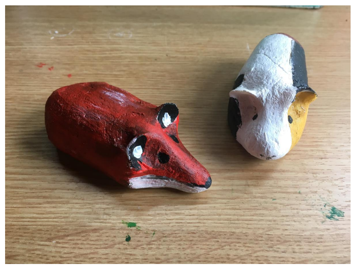
Foxy and Guinea Pig

Some other creatures that I found online; can you see where I got the Foxy inspiration from? Keep them chunky, small bits fall off!