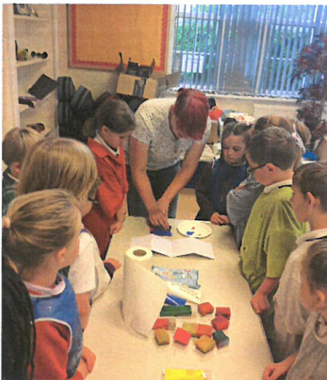
Art Week activities organised by FOLS

We ensure that all pupils have equal access to the full range of educational opportunities provided by the school.