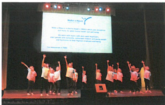
Taking part in Dance Umbrella at The Forum in Bath

We work in collaboration with outside agencies e.g. community groups, county personnel, charities, the police, Social Services and our local area health team.