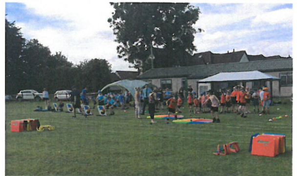
FOLS support the school at Sports Day