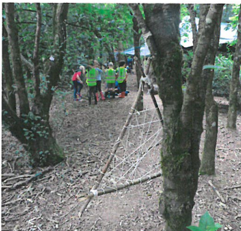
Art Week activities at Wren Woods

Our Special Educational Needs and Disability policy can be accessed via the school's website.