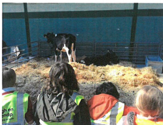
Field to Food Learning Day at the Royal Bath and West Showground