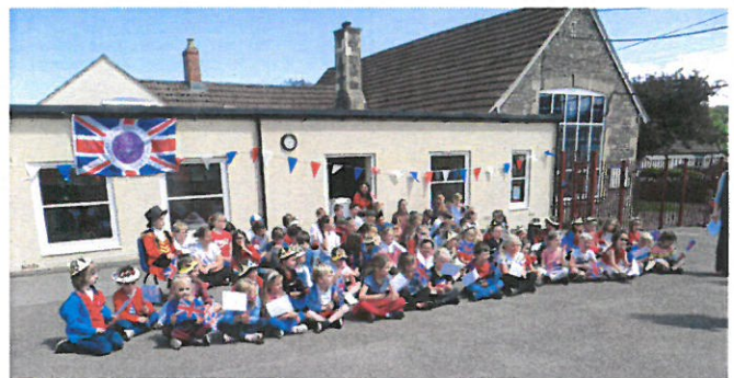
Celebrating the Queen's Jubilee

Parent Governors are important members of the Governing Body and all parents are members of our Friends of Leigh School (FOLS) group.