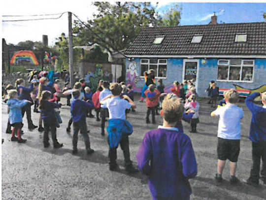
Dance workshops funded by FOLS