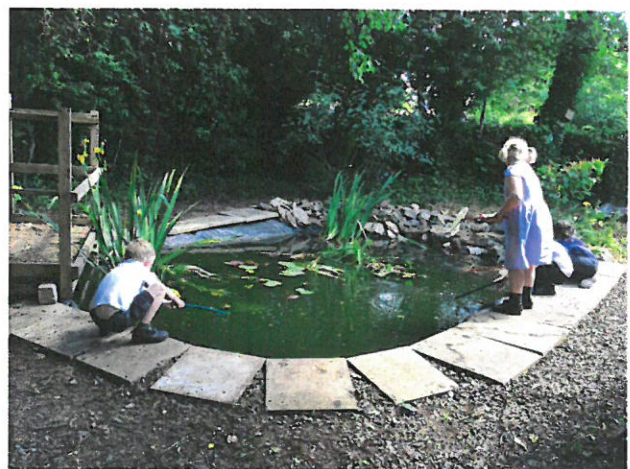
Pond Dipping in the school pond