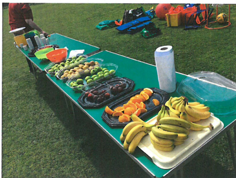
Refreshments at our Sports Day

Water is available throughout the school day, both in the classrooms and outside in the playground. Children in Years R, 1 and 2 have food provided by the School Fruit and Vegetable Scheme during morning break.