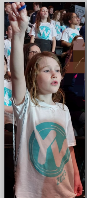
Young Voices Concert, Birmingham