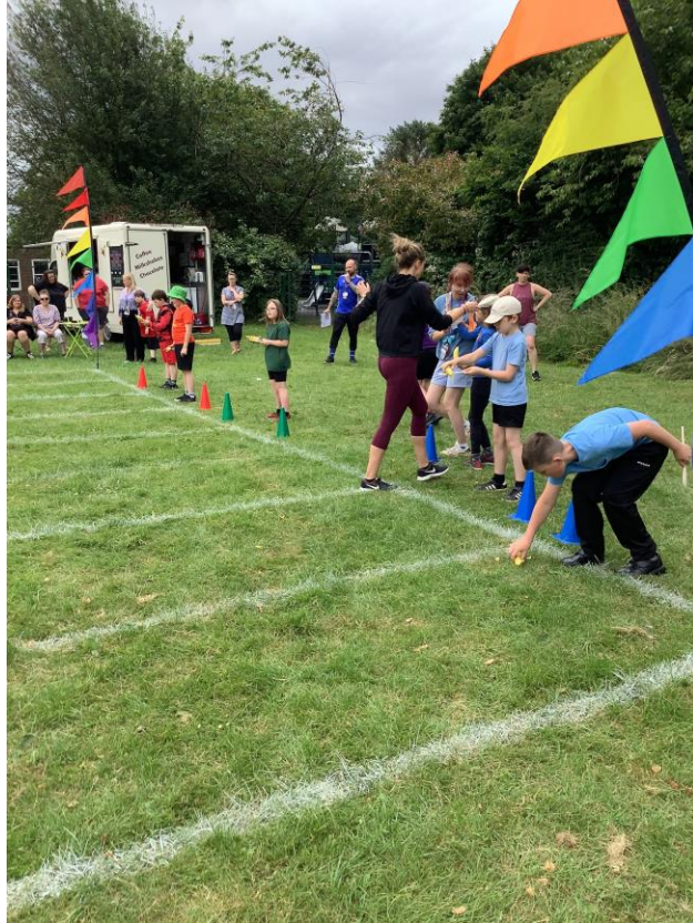
Longleat - Kids Day Out