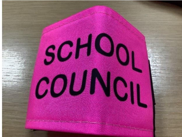
Meet the new Critchill Council