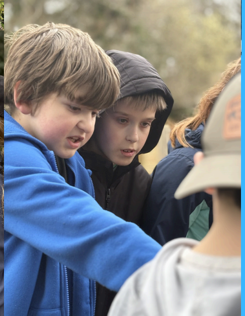
Year 5 and Year 6 children living life to the fullest on their residential trip to Kilve Court in Somerset.