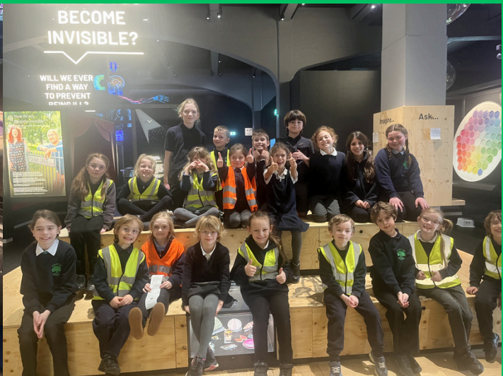
Year 1 - Year 6 children on their school trip to Bristol, exploring all that "We The Curious" had to offer.