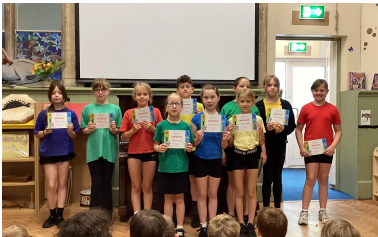
The Year 3 / 4 gymnastics team with their certificates.