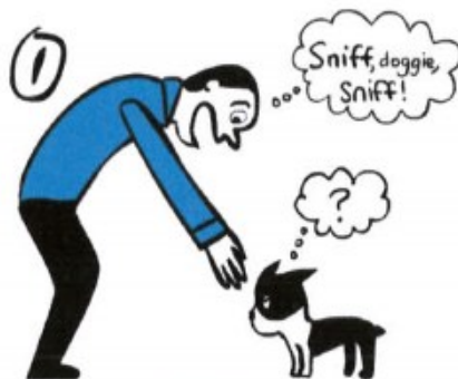
DON'T Lean over the dog & stick your hand in his face

Most people do this stuff and it stresses dogs out so they BITE! I don't care how cute you (or your kid) think Boogie is. Please show him some respect.