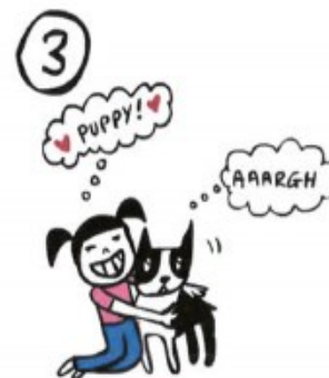
DON'T Grab or Hug him