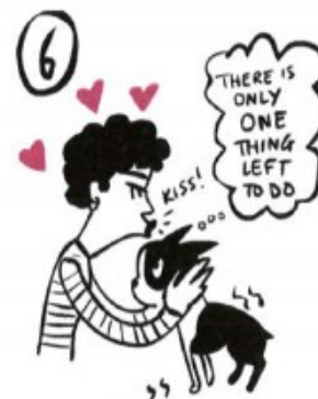
DON'T Grab his head and kiss it (This is an invasion of space)

Doing this to a dog who doesn't know you is like a perfect stranger giving you a great big hug and kiss in an elevator. Wouldn't that creep you out? And wouldn't you have the right to defend yourself?