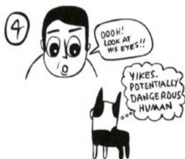
DON'T Stare him in the eye (This is an adversarial gesture)