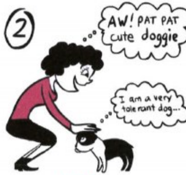
DON'T Lean over the dog & stick your hand on top of his head