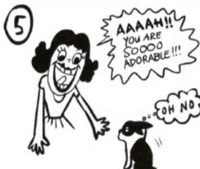
DON'T Squeal or shout in his face