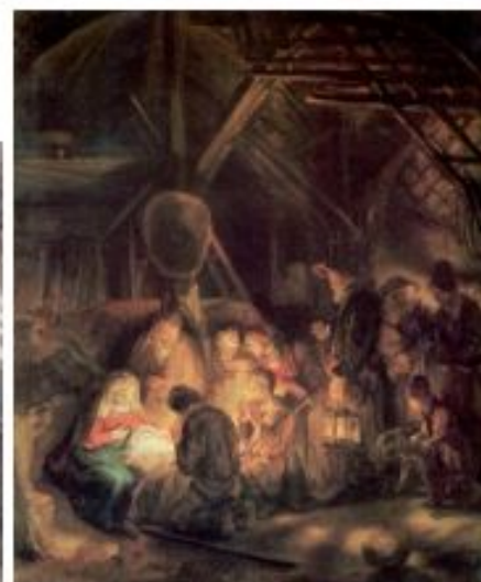
The Adoration of The Shepherds - Rembrandt Harmenszoon Van Rijn (1646)