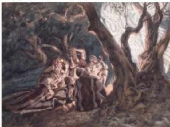
The Angel and The Shepherds - James Tissot (1886-94)

Surely the idea that everyone, no matter what, is welcomed and accepted is the true meaning of Christmas?