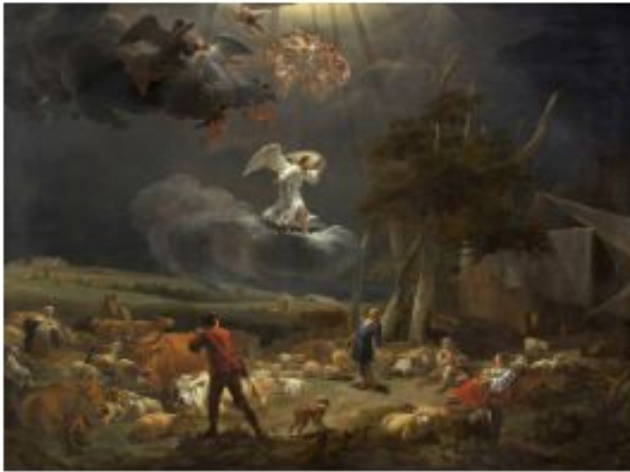
The Annunciation To The Shepherds - Nicolaes Pietersz Berchem (c.1630)

'And there were shepherds living out in the fields nearby...An angel of the Lord appeared to them, and the glory of the Lord shone around them, and they were terrified..."Do not be afraid. I bring you good news that will cause great joy for all the people. Today...a Saviour has been born to you...This will be a sign to you: You will find a baby wrapped in cloths and lying in a manger."' (Luke 2:8-12)