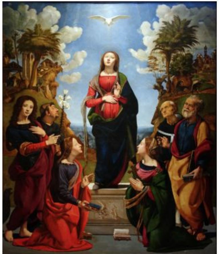
Immaculate Conception with Saints - Piero di Cosimo (c.1485-1505)

I hope and pray that this Christmas time you may find the knowledge of God and his glory as it is displayed in the face of Christ.