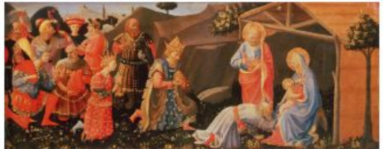
The Adoration Of The Kings - Zanobi Strozzi (1433-34)

But giving Jesus gold was referring to him as the promised king.