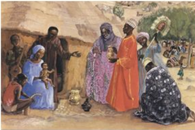
Visit Of The Three Wise Men - Jesus Mafa (1973)

'When they saw the star, they were overjoyed. On coming to the house, they saw the child with his mother Mary, and they bowed down and worshipped him. Then they opened their treasures and presented him with gifts of gold, frankincense and myrrh.' (Matthew 2:10-11)