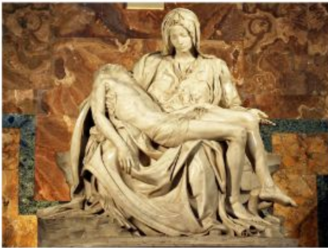
Pietà – Michelangelo Buonarroti (1499)

"If you had the cure for cancer, surely you would want to tell the world?"