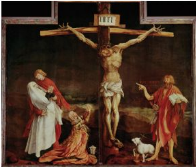
'The Crucifixion' from the Isenheim Altarpiece – Matthias Grünewald (1512)

'But he was wounded for the wrong we did; he was crushed for the evil we did. The punishment, which made us well, was given to him, and we are healed because of his wounds.' (Isaiah 53:5 NCV)